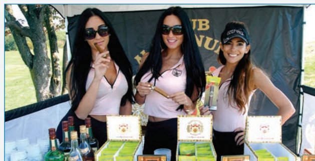
Linx and Lace Girls under the Macanudo Tent with Jameson and Macanudo cigars