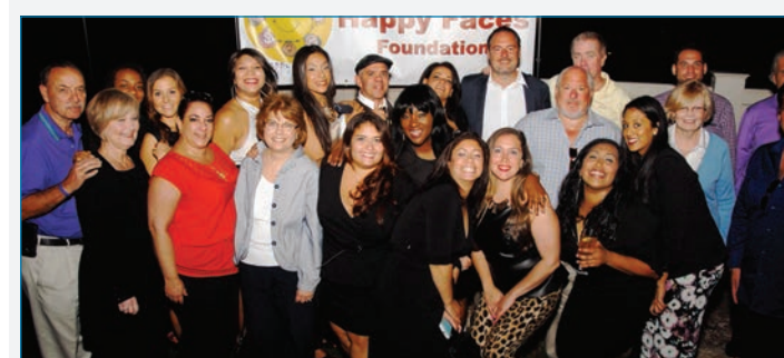
Happy Faced Century Management Team