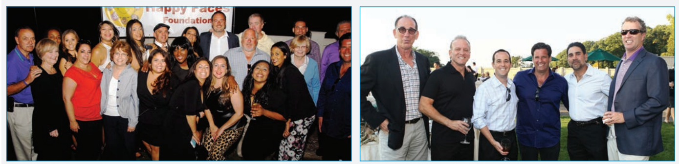
Happy Faced Century Management Team