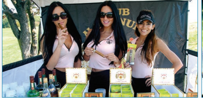
Linx and Lace Girls under the Macanudo Tent with Jameson and Macanudo cigars